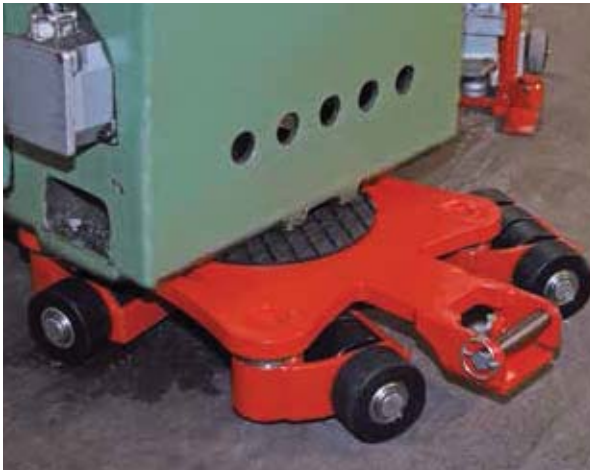
Revolving trolley JKB in action.

according to technical regulation ANSI/ASME (USA)