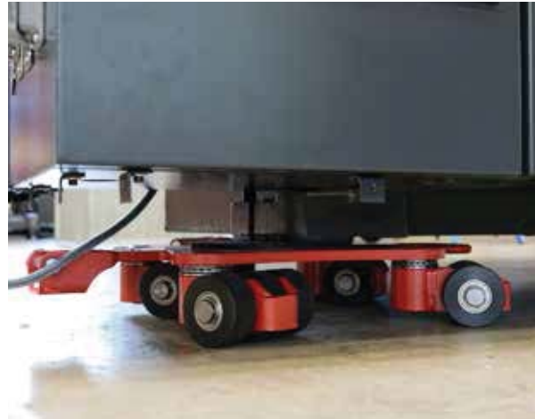
Revolving trolley JKB in action

For information on matching ACCESSORIES see Pages 66-67.